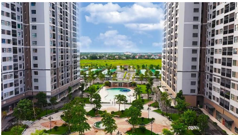
Vinhomes Condonium New Centre

Proposals, programs, agendas for green city, sustainable urban development