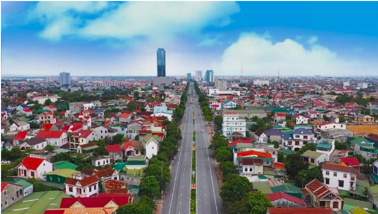
National Highway 1A across the city

Upgrading, restoring/asphalting road network, pavements, enhancing lighting system