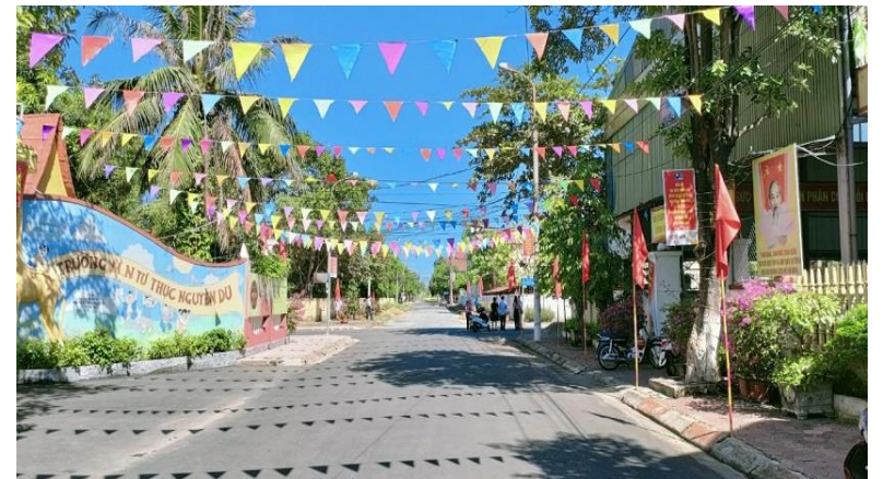
Showcase of “Bright – Green – Clean – Beautiful Road”