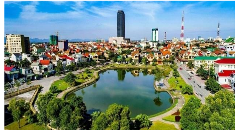
A corner of city park