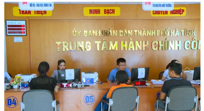
IT Application to Public Services