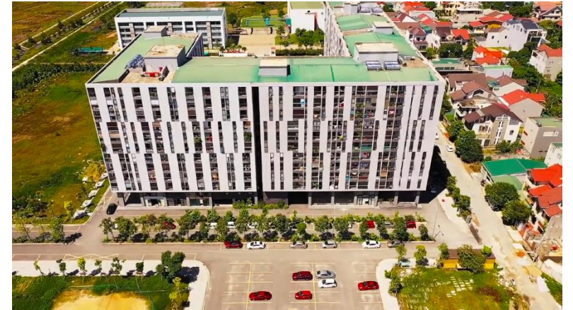
Social Housing Project