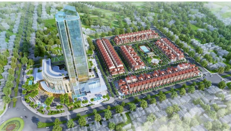
City Plan for Greening the City

Improving community living standards in residential areas