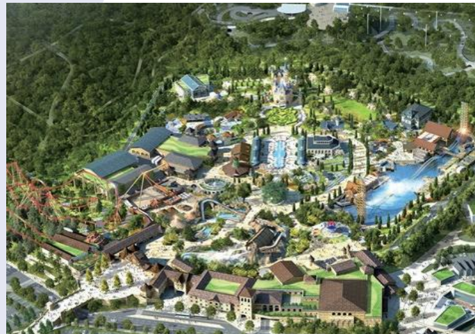
OSIRIA Tourism Complex