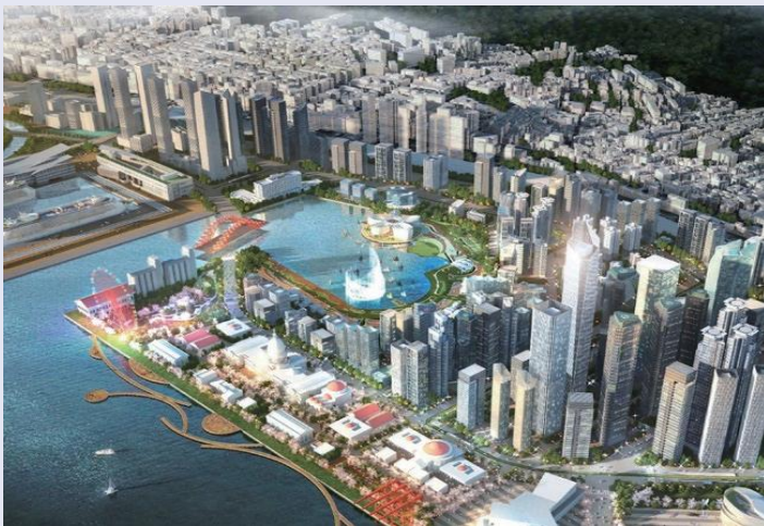
2030 Busan World Expo (North Port)

The city's natural endowments and rich history have resulted in Busan's increasing reputation as a world-class city for tourism and culture , and it is also becoming renowned as a hot spot destination for international conventions .