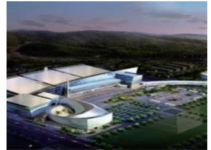
BEXCO Exhibition Center III