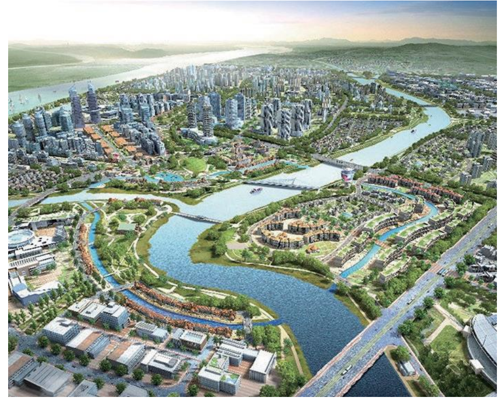
Bird's-eye view of Eco Delta Smart City