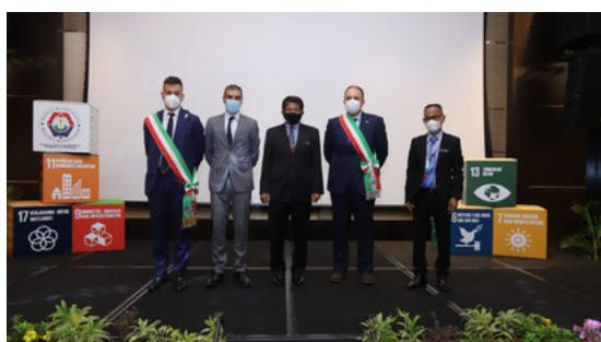
NCI-Bologna to Melaka 17 - 19 May 2022