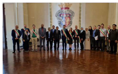
16 - 22 October 2022 Melaka to NCI-Bologna